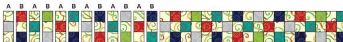
ROW 2 ASSEMBLY DIAGRAM