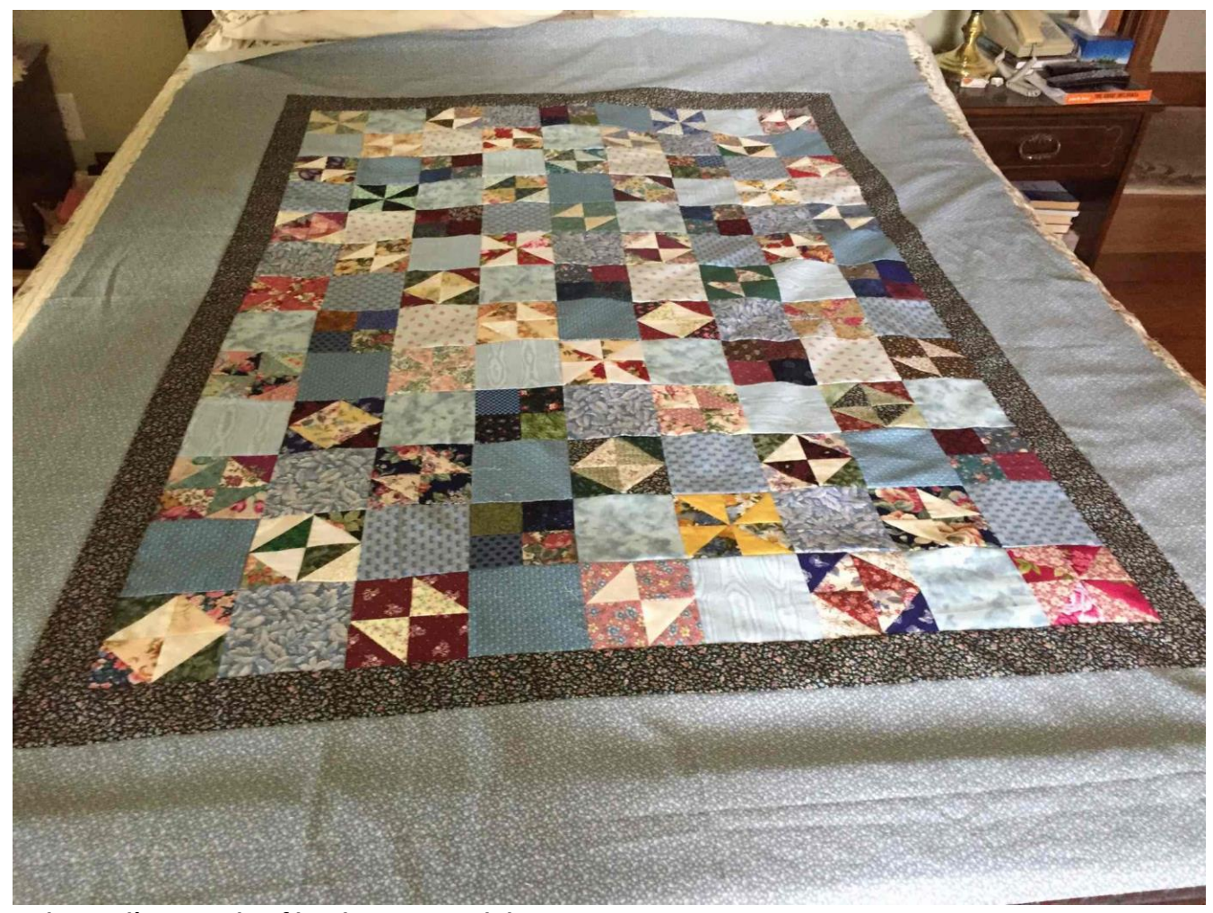
Judy Boyd's example of her layout possibility.....

There will be some samples put on the guild Facebook page