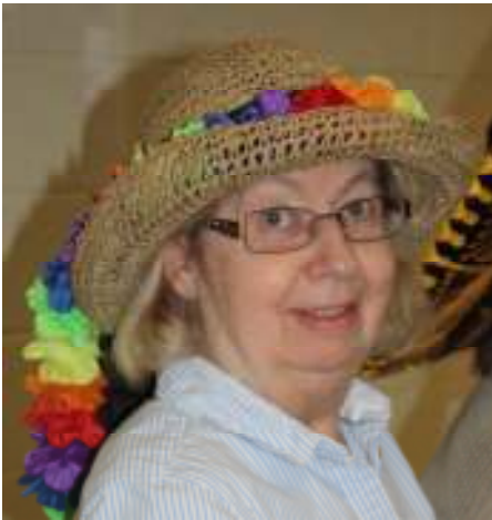
May Show and Tell

Next Meeting: Monday September 2014—Date to be announced.