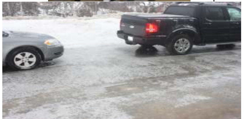
And this is a workshop we won't forget too soon. Just look at the ice!