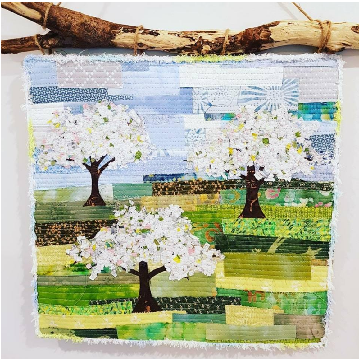
"Springtime Apple Orchard" Art Quilt by Darcy Hunter of Darcy Doodle Quilts